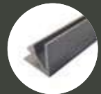
Inside corner trim