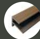
End trim F-shaped