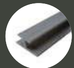
Joining trim I-shaped