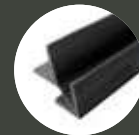
Outside corner trim